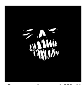
Contaminated Well (1 base tile)